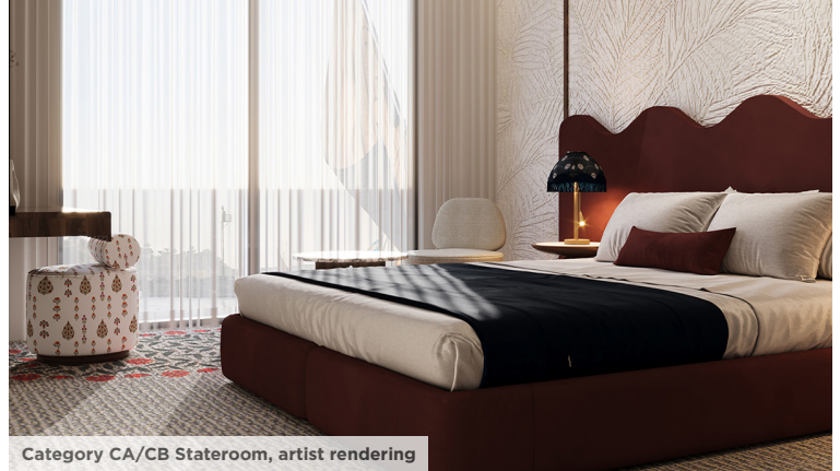
Category CA/CB Stateroom, artist rendering