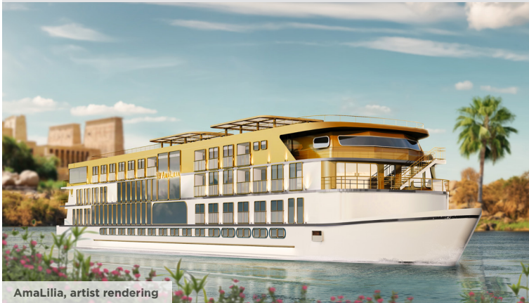
AmaLilia, artist rendering